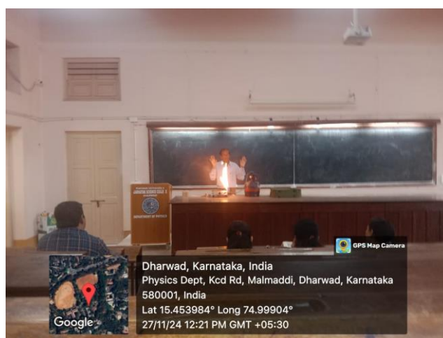
Figure 1. Dilip Patravali explained the use of a device manufactured from GASSAFE INDIA CO., PUNE for enhancing the safety of using domestic gas, and demonstrated the effective use of the device